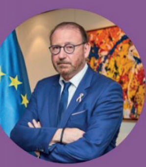
Rik Daems, President of the Parliamentary Assembly of the Council of Europe